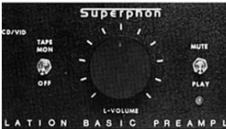
Superphon Revelation preamplifier