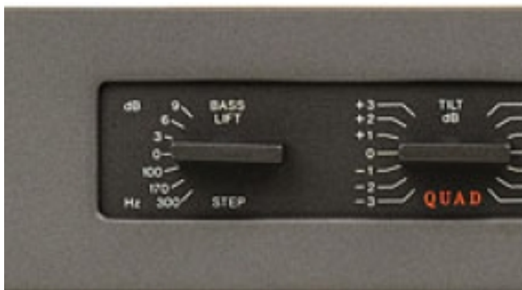
Quad 34 preamplifier