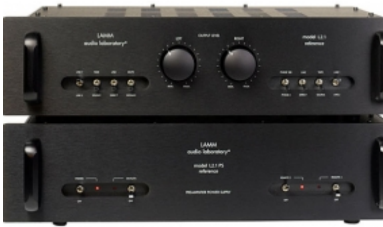
Lamm Industries L2.1 Reference preamplifier