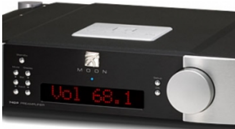
Simaudio Moon Evolution 740P line preamplifier