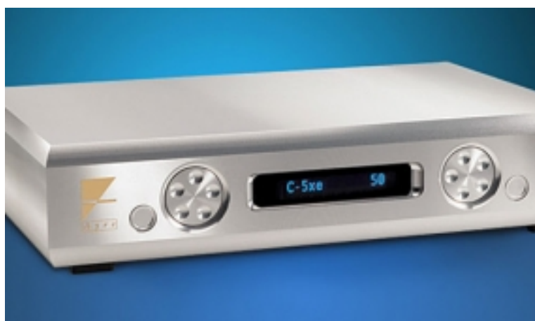
Ayre Acoustics KX-R Twenty line