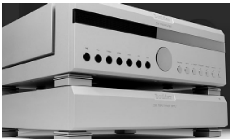
Boulder Amplifiers 2110 line