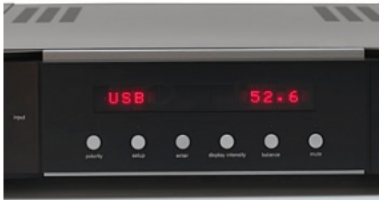
Mark Levinson No.526 preamplifier